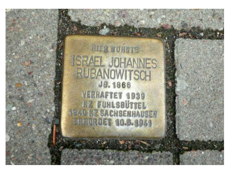
Schulweg 48, Hamburg

Israel Johannes Rubanovitsch, born on 12.05.1866 in Rechitsa, today Belarus, arrested multiple times, killed on 4.6.1941 in extermination camp Pirna-Sonnenstein.